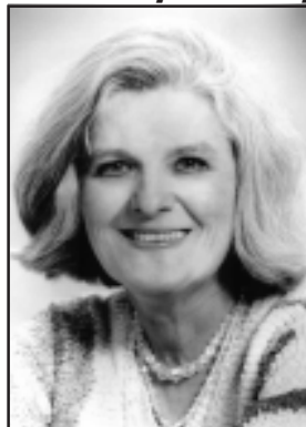
Speaker, Entertainer, Historian